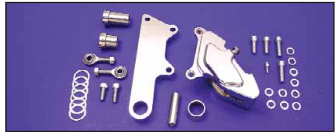
Edart Brake Kit fits 1988-up FXST 4 piston design front springer forks. VT No. 23-0786