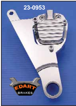
Edart Chrome Caliper Kit fits 1988-up FXSTS. Use with 5/8" master cylinder. VT No. 23-0953