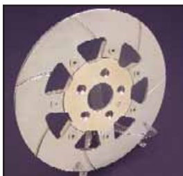
GMA 11.5" Front Disc Brake Discs are cast iron with aluminum center. Note: Brake disc should not be polished or cleaned. All front brake discs are floating type rear brake discs are 2 pc design non-floating.