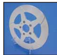
Front GMA 11.5" Brake Discs are made of ductile iron alloy, which provides increased friction coefficient, high heat capacity and high warp resistance.