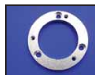
VT No. 34-0673

CV Adapter Plate will rotate 34-0670/34-0451 to vertical position on CV carbs.