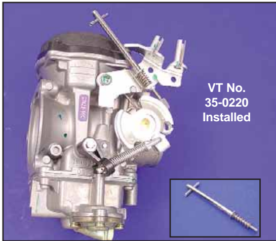
VT No. 35-0220 Installed

Keihin and CV Idle Screw allows for easier adjustment by hand. VT No. 35-0220