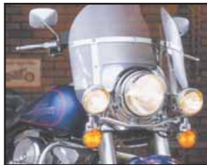
33-0540 Headlamp and Spotlamp Assembly shown. Order visors separately.