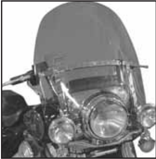
1989 FLT Shown w/Chrome Headlamp Trim, Windshield and Spotlamp Kit