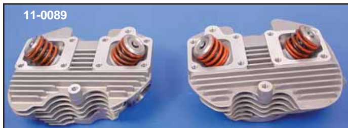
11-0089 1966-77 O-Ring Style