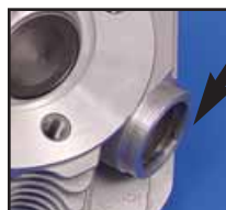
1978-84 Rubber Band Style

Replica Shovelhead Head Sets are completely assembled with unleaded valve seats, cast iron valve guides, nitrated valves, valve guide seals and stock type valve spring kit. Fits all 1966-84 Big Twins. Order stud set separately.