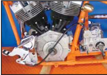
VT No. 22-0705 Installed