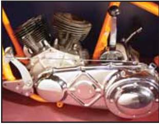
VT No. 22-0703 Installed