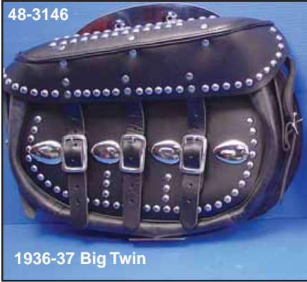
1936-37 Big Twin